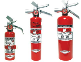
Aluminum Valve A384T B385TS B386T