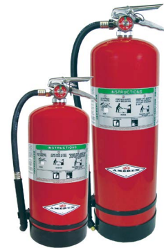
Coast Guard Approved