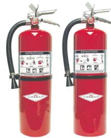
Model 397 Model 398