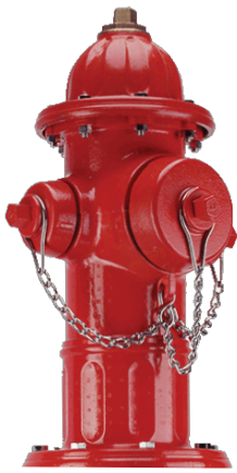
SUPER CENTURION FIRE HYDRANT (A-423)

Mueller fire hydrants are known throughout the fire protection industry for superior flow characteristics, dependability, ease of repair, and aftermarket support. Super Centurion® hydrants are manufactured in a Mueller ISO 9001 Registered facility in Albertville, Alabama, USA and are backed by a 10-year limited warranty on materials and workmanship.