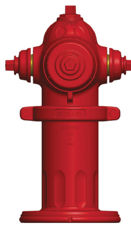
SUPER CENTURION FIRE HYDRANT (A-403)