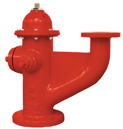
MONITOR STYLE SUPER CENTURION FIRE HYDRANT (A-479)