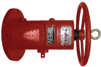
WALL-TYPE INDICATOR POST (A-20814 4" - 14")

Mueller indicator posts are used in fire protection systems and perform several functions. The indicator post provides a means to operate a buried or otherwise inaccessible valve. Also, the indicator post readily and clearly indicates whether the valve is open or shut.