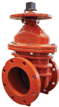
350 PSI POST INDICATOR RESILIENT WEDGE GATE VALVE (PIV) (P-2361)

Mueller UL listed and FM approved check valves are gravity operated, swing check design. These check valves are rugged in construction and simple in design. Our 2" - 12" sizes are now rated at 350 psig and feature ductile iron construction, Buna-N disc seat as standard (optional EPDM available) and bronze body seat rings as standard.