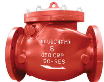
350 PSI SWING CHECK VALVE (A2122B1)