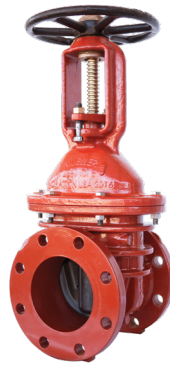
OS&Y RESILIENT WEDGE GATE VALVE (R-2361)