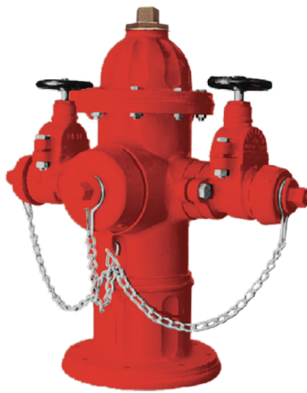
SUPER CENTURION WITH INDEPENDENT HOSE GATE VALVES (A-423-370)