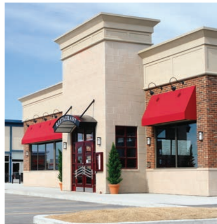
High Strength Waste