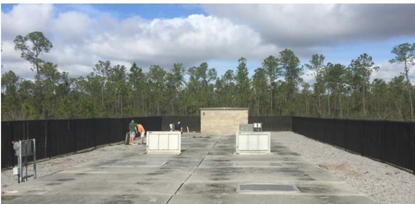
30,000 gallon decentralized treatment system