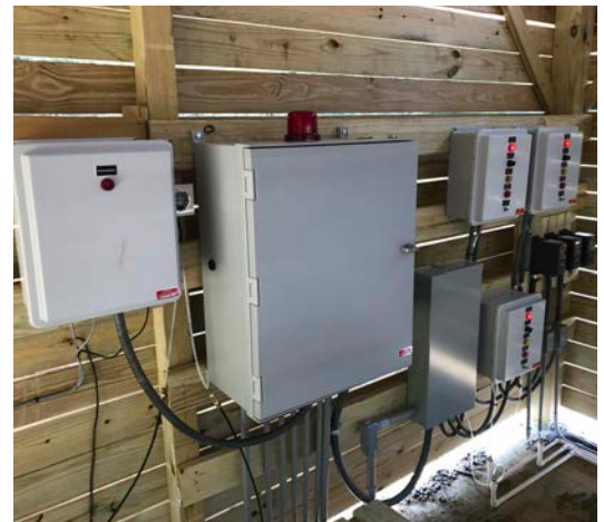
Electric control console provides complete and simple operation