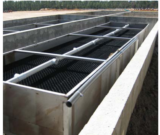
Easily installed into precast or cast-in-place concrete tanks