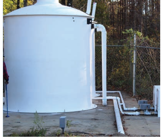
Fiberglass tank options are available in a variety of horizontal and vertical configurations/sizes.

The ECOPOD houses an engineered plastic media specifically designed to act as a structural support that facilitates biofilm growth. The media is completely contained and submerged in the reactor, which works as a treatment and mixing zone. There are no moving mechanical parts in the ECOPOD. In this system, conditions are very favorable to attached growth bacteria, meaning common process disruptions such as sludge bulking or washouts are eliminated. The ECOPOD offers a complete aerobic treatment solution utilizing the developed biofilm on the media support by simultaneously reducing cBOD, TSS, and ammonia concentrations typical of commercial wastewaters. This sets the stage for up to 50% total nitrogen removal when carbon is present since denitrification can proceed in the anoxic zones surrounding the ECOPOD reactor system within the larger housing tank.