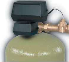
2" Valve with meter option