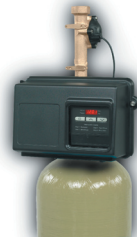
1 " Valve with meter option