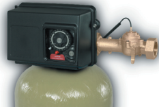
1 1/2" Valve with meter option